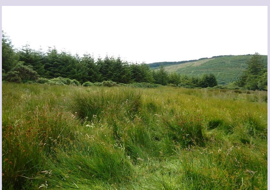
Figure 2: Field images of some of the typical High Nature Value farmland habitats in the Munster South Connaught CP: extensive wet grassland (top); upland grassland (middle); heath and blanket bog (bottom).

The CP is predominantly comprised of extensive upland areas with a mix of commonage and private land, and a mix of intensively and extensively farmed lowlands and valleys (Fig. 2). The farmland habitats include significant areas of blanket bog, heath, wet grassland, and woodland. Notable species include Hen Harrier (a bird of prey), breeding waders (for example Curlew), Lesser Horseshoe Bat, and Red Grouse.